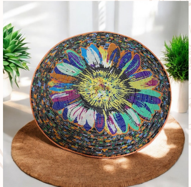
SUNFLOWER TABLE MAT BY KERRY BOWES

We are open every day (yes... Sunday too!) Make a plan to stop by!