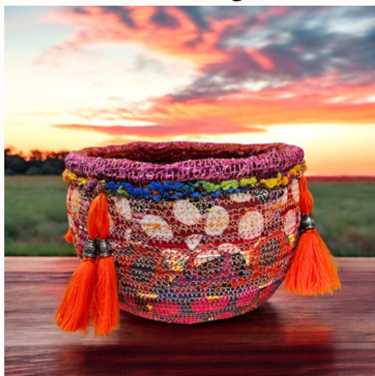
"ZIPPITY DOO DOT #3" BY KERRY BOWES